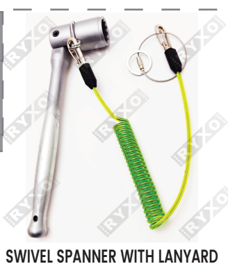
Material: PU + Steel