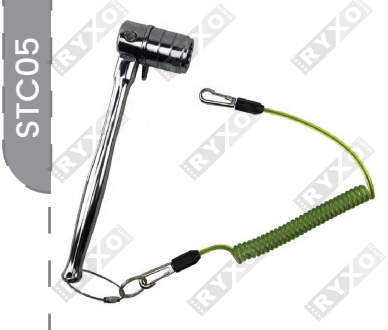
SCAFFOLDING SPANNER Material : Steel Feature: With swivel&Lanyard hook Mirror finish