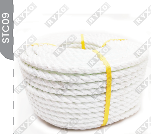
SCAFFOLDING LIFTING ROPE

Material: Polypropylene : 18mm x 100Mtr 16mm x 100Mtr