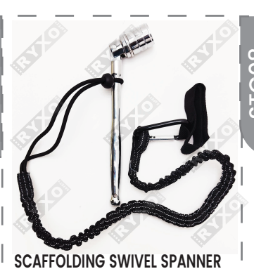
Material: Steel Feature: With cotton elastic sleeve : 7/16